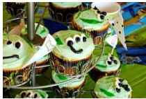
gooey, green eye ball cupcakes

Draw and label some alien food for example